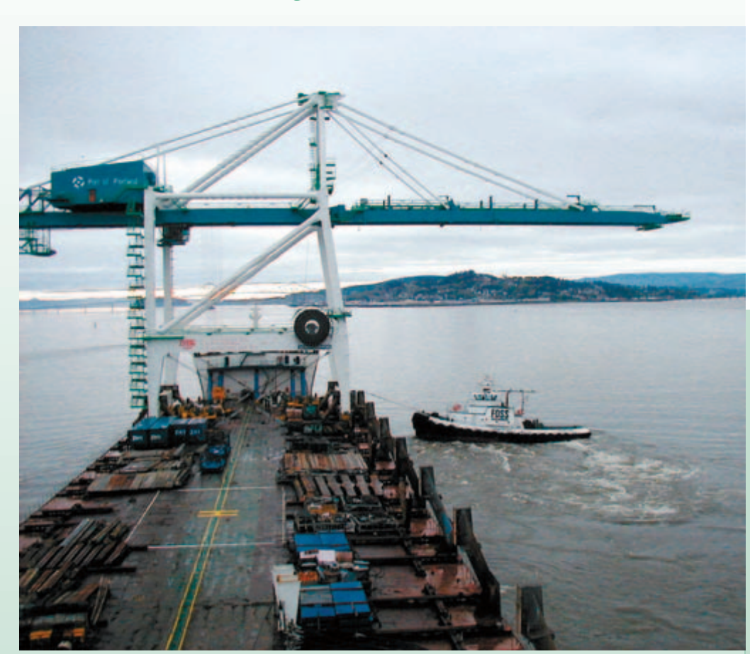
With the Daniel Foss assisting, the Zhen Hua 1 approaches the Astoria Bridge over the Columbia River on the way to the Port of Portland.

The Seattle cranes are slightly larger, able to reach across 22 containers, than the Portland cranes, which are 18-wide. All of the cranes stand about 250 feet tall to the apex and 381 feet with the booms up following installation, but the Portland crane was 50 feet shorter on the ship to enable passage under the bridge.