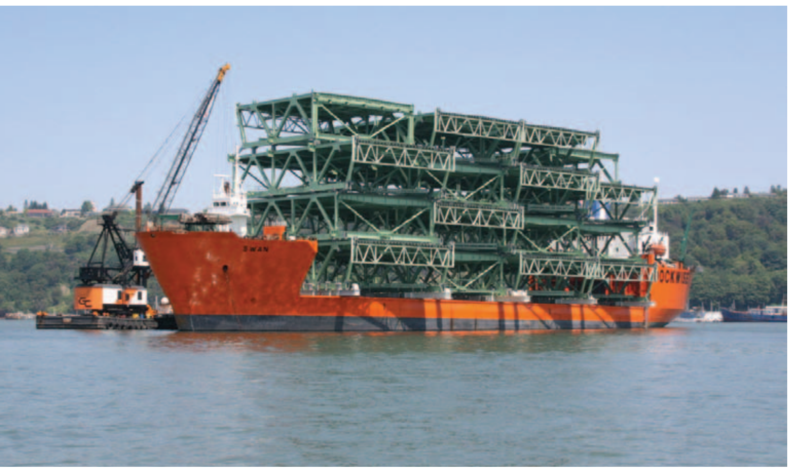
The heavy-lift ship Swan arrives in Tacoma's Commencement Bay on June 8, carrying the first of three loads of roadway sections for the new Tacoma Narrows suspension bridge. Most of the sections are 120 feet long and weigh 450 tons, but the heaviest weigh about 600 tons.

Most of the barge modifications were performed at the Foss yard on the Lake Washington Ship Canal. With the drives, however, the barge would have been too wide to move through the Hiram Chittenden Locks into Puget Sound, so Foss workers moved the barge to Northland Marine on the Duwamish Waterway to install them.