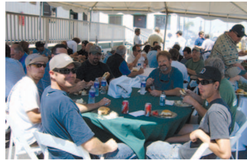
About 50 people from Foss and 15 from Chevron Shipping attended a barbecue in early April hosted by Foss to recognize an injury- and accident-free year at Chevron's Pacific Area Lightering operation.

As for the transfer operation itself, Chevron and Foss recently held a first-