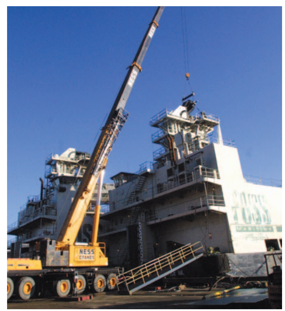
A Ness crane lowers a new "pocket belt" into position at the top of the elevator tower of the lightering barge Noatak. The belt distributes ore to the barge's boom conveyor system.