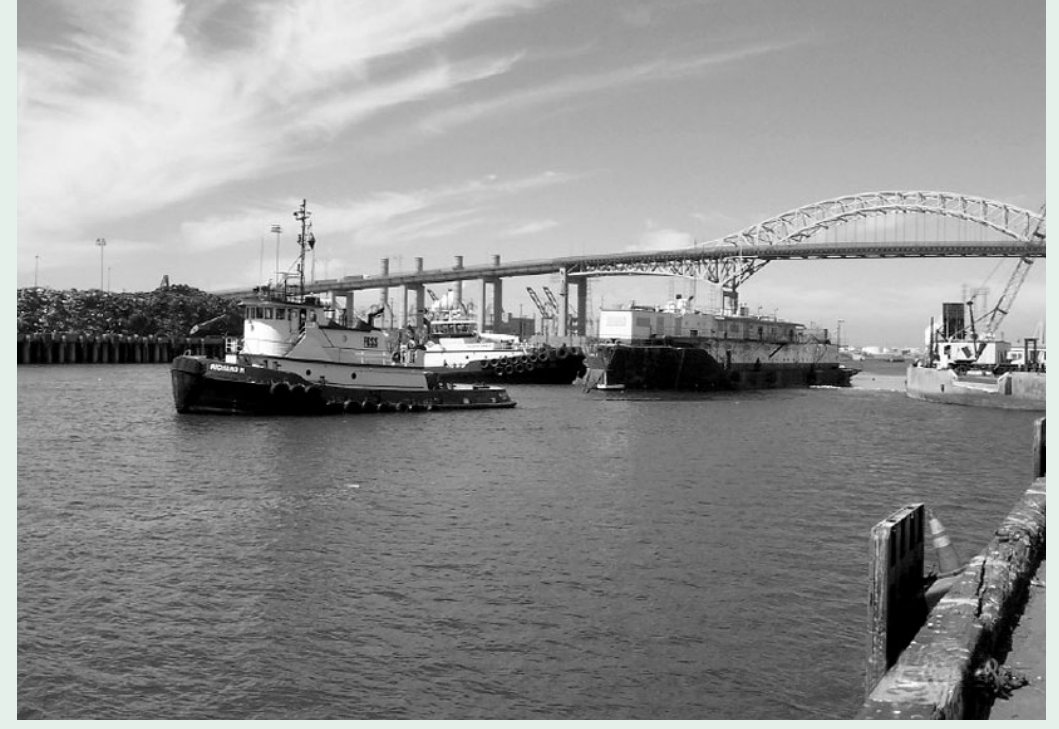
The surplus barge that for more than 50 years has housed offices for Foss and its predecessor company in Long Beach is towed out of the Southern California port toward San Francisco Bay, its new home.

"You can go into the bilge and blow in it and get dust on your face."