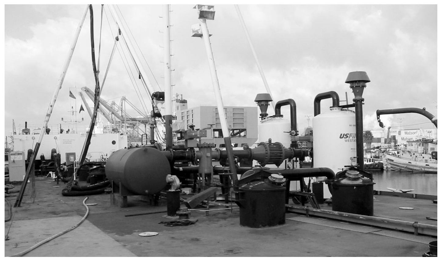
The tankbarge San Pedro is now equipped to process vapors displaced when tankers load cargo.

Fuel and Marine Marketing (FAMM), ChevronTexaco's marine fuels division, also was a stakeholder in the project.