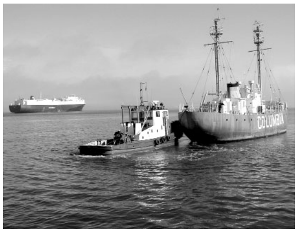
The Foss tug Tiger assists the lightship Columbia at the Columbia River Maritime Museum in Astoria, Oregon.

The Columbia served as a light ship off the Columbia River Bar from 1951 until 1979, when it was replaced by a lighted horn buoy.