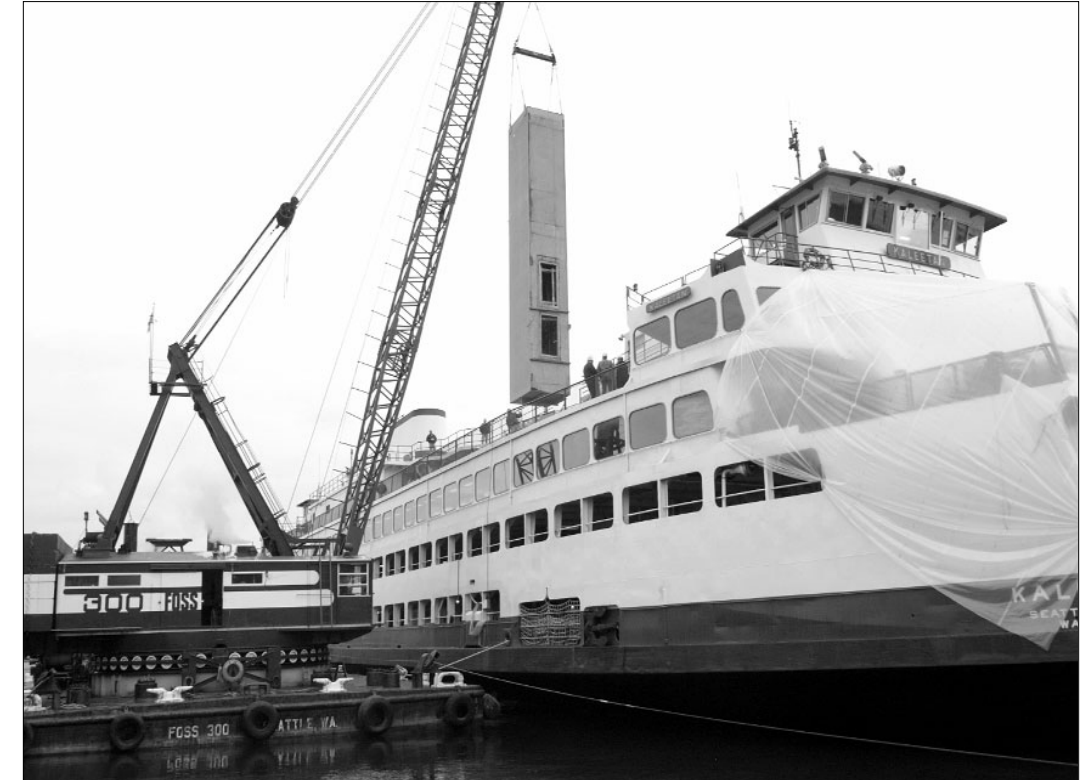
The steam derrick Foss 300 lowers a 47-foot-long, 33,000-pound elevator shaft into the Washington state ferry Kaleetan.

Foss cut 4-by-12 foot holes in the ferry's car deck to install the new generators. A somewhat smaller hole will be required to install the switchboard, which will go in the engineer's operating station amidships. The panel