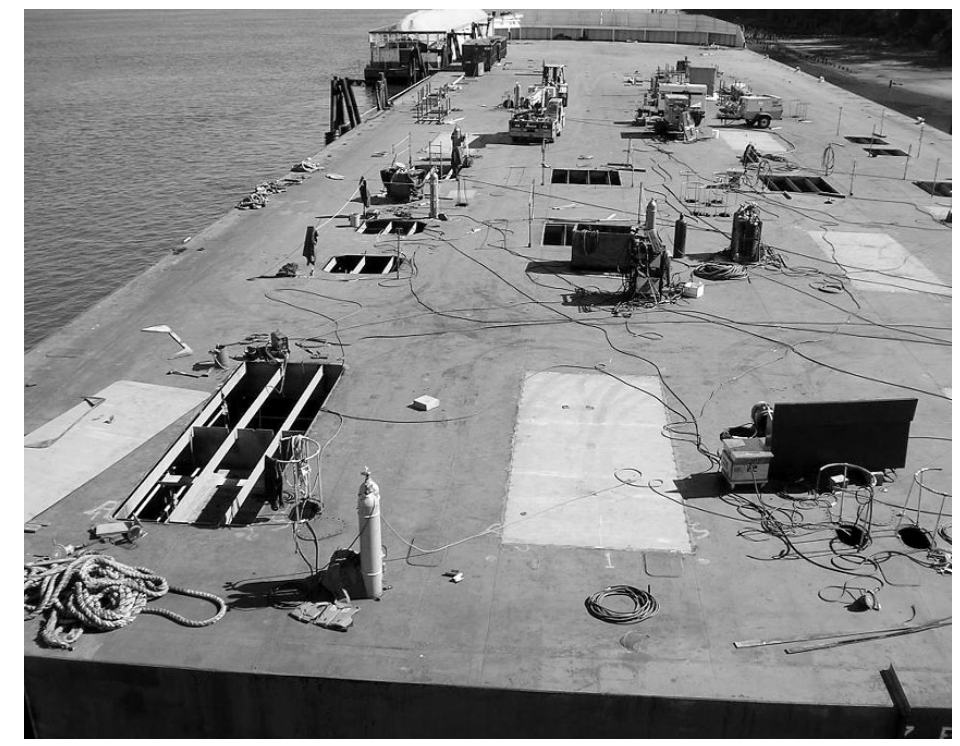
Workers at the Foss Rainier Shipyard installed 19 new deck plates on the Z Big 1.

Silva credited Schreiner with doing "an excellent job running the project