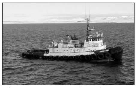
The Stacey Foss, near the Red Dog Mine Port in Alaskan Arctic

He also credited the tug and barge crews with responding effectively to help mitigate an on-land fuel spill at the port, putting their hazardous materials training to work to assist personnel