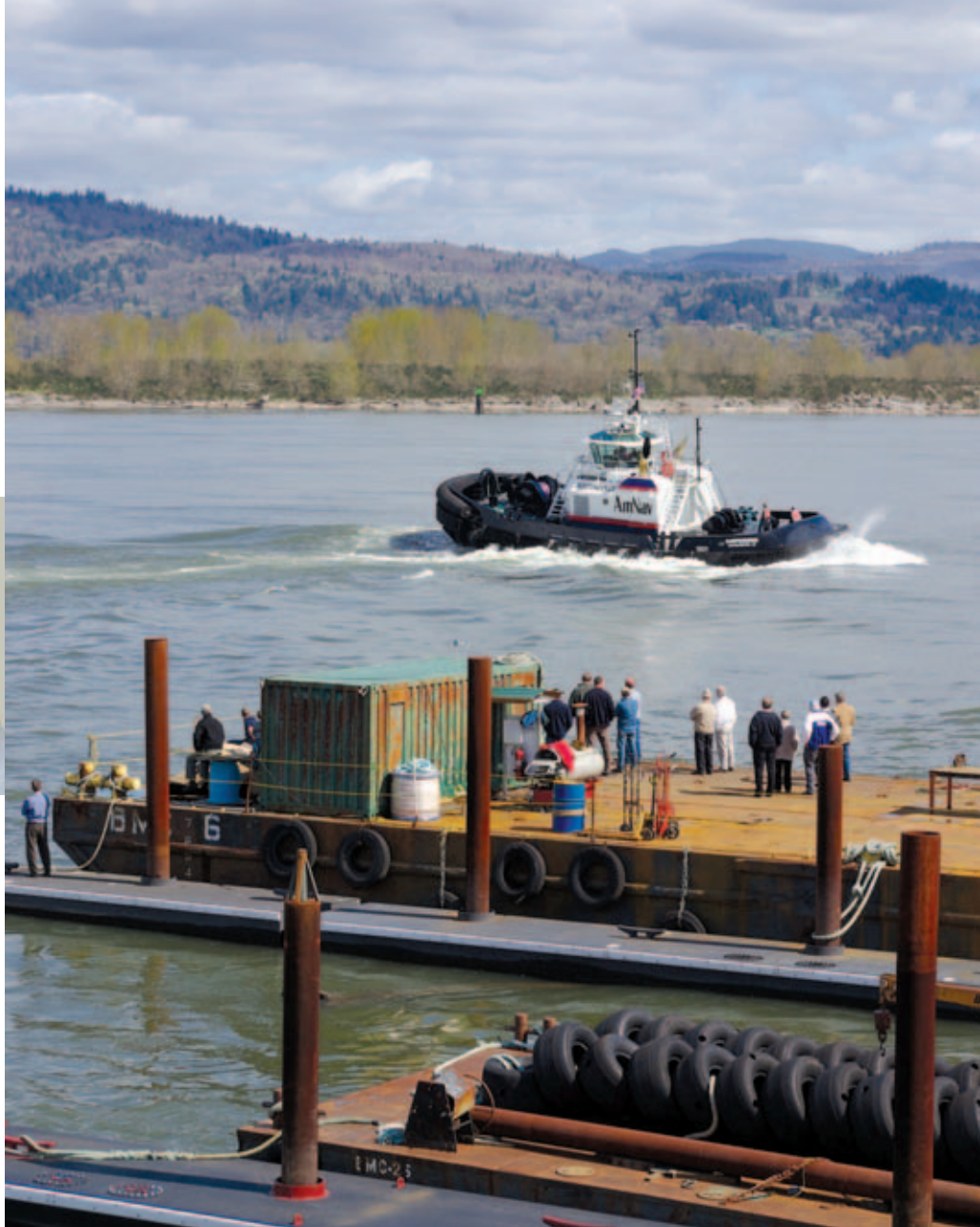
The Independence puts on a display of maneuverability in the Columbia River at Foss Rainier Shipyard.