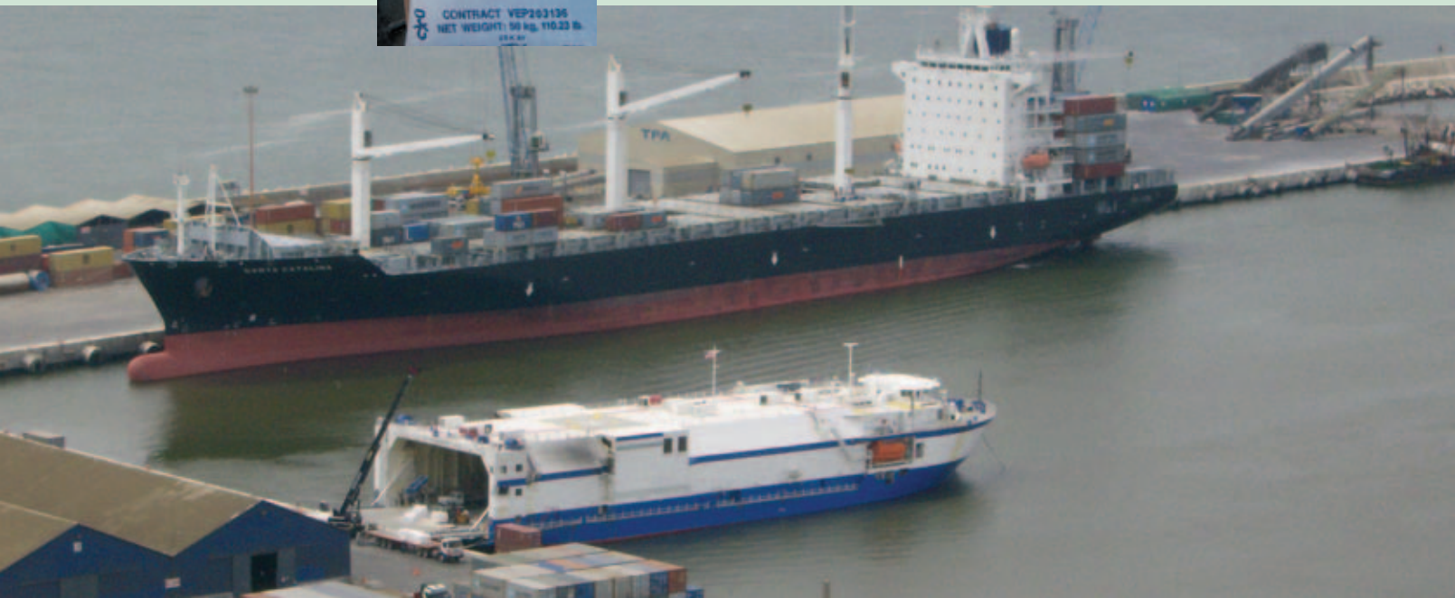
The Delta Mariner is moored stern-in in Arica, Chile, for cargo operations.