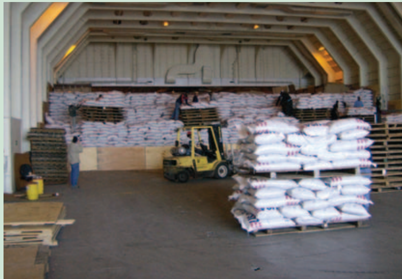
Forklifts working with pallets of bagged food in the cargo bay.