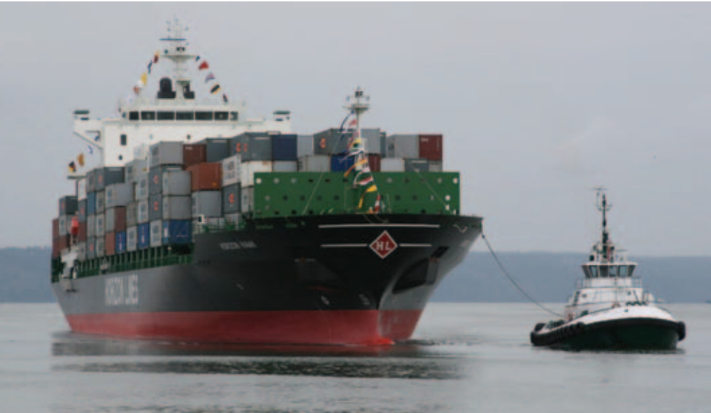
The tractor tug Andrew Foss leads the Horizon Hawk on its maiden voyage into Tacoma.

As of July 2007, Horizon Lines plans to operate 17 active ships and to have four vessels in reserve status. The average age of the company's active vessel fleet will be 20 years.