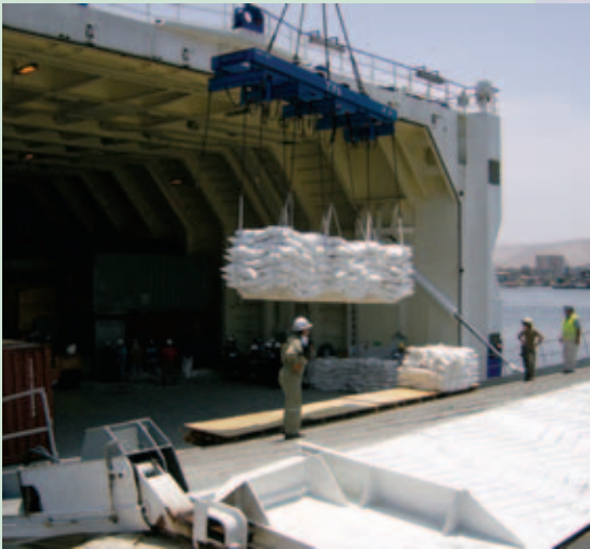
A top-pick machine, normally used to handle containers moves the food cargo to the pier.