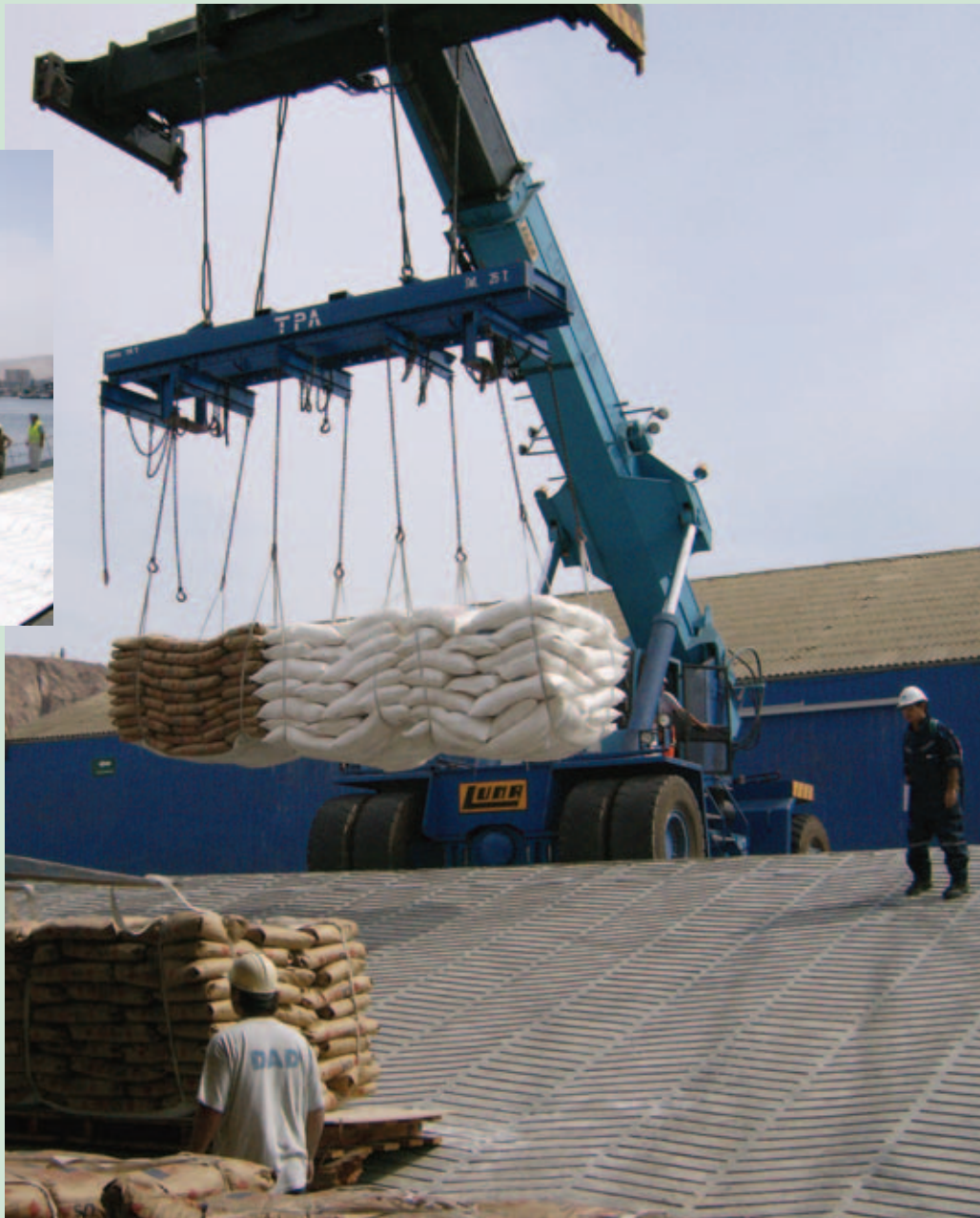
Slings were used to discharge bags bound for Bolivia.