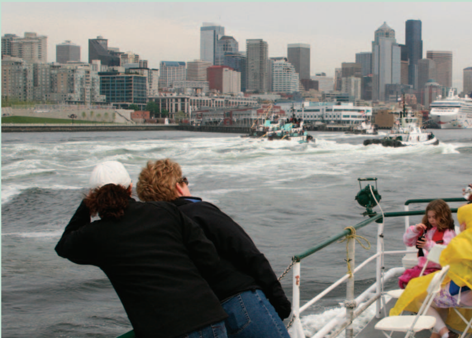
Guests on the Lindsey Foss stretch to get a better view of the 2007 tug races on Seattle's Elliott Bay.