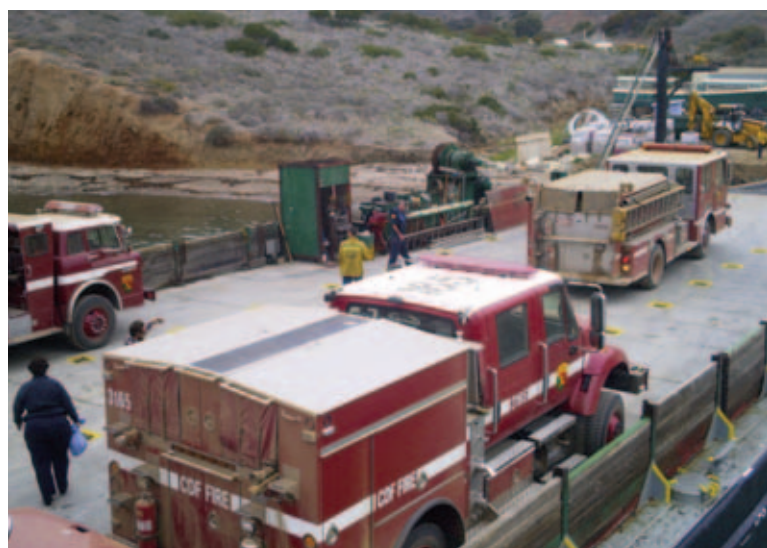
Firefighting equipment rolls onto the barge PT&S 379 after use on Catalina Island.

The California State Department of Forestry and Fire Protection was