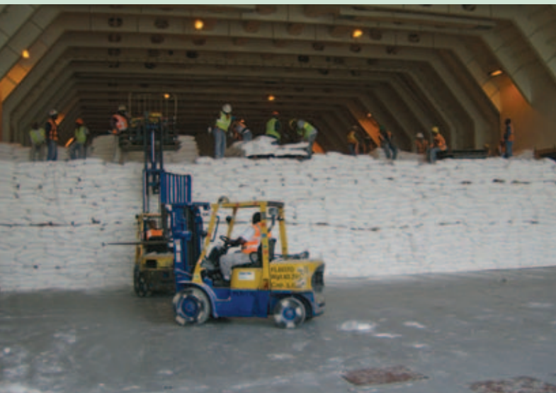
More than a dozen Chilean dockworkers place bags on pallets.