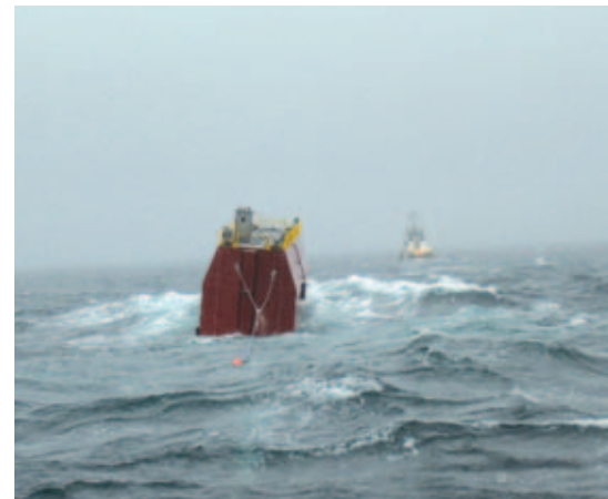
The caisson tips up in a wave during the trip from Portland up the coast of Washington.

Technical: The lead tug was set up to tow with 2,000 feet of two-inch wire, and the stern tug was set up with nine-inch plasma towing bridles with two-and-a-quarter-inch wire pennants. The bridles were married to 60 feet of five-inch plasma line, which was married to 600 feet of nine-inch nylon line.