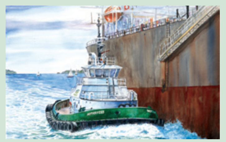
June, The Arthur Foss Asssisting a Tanker on San Francisco Bay