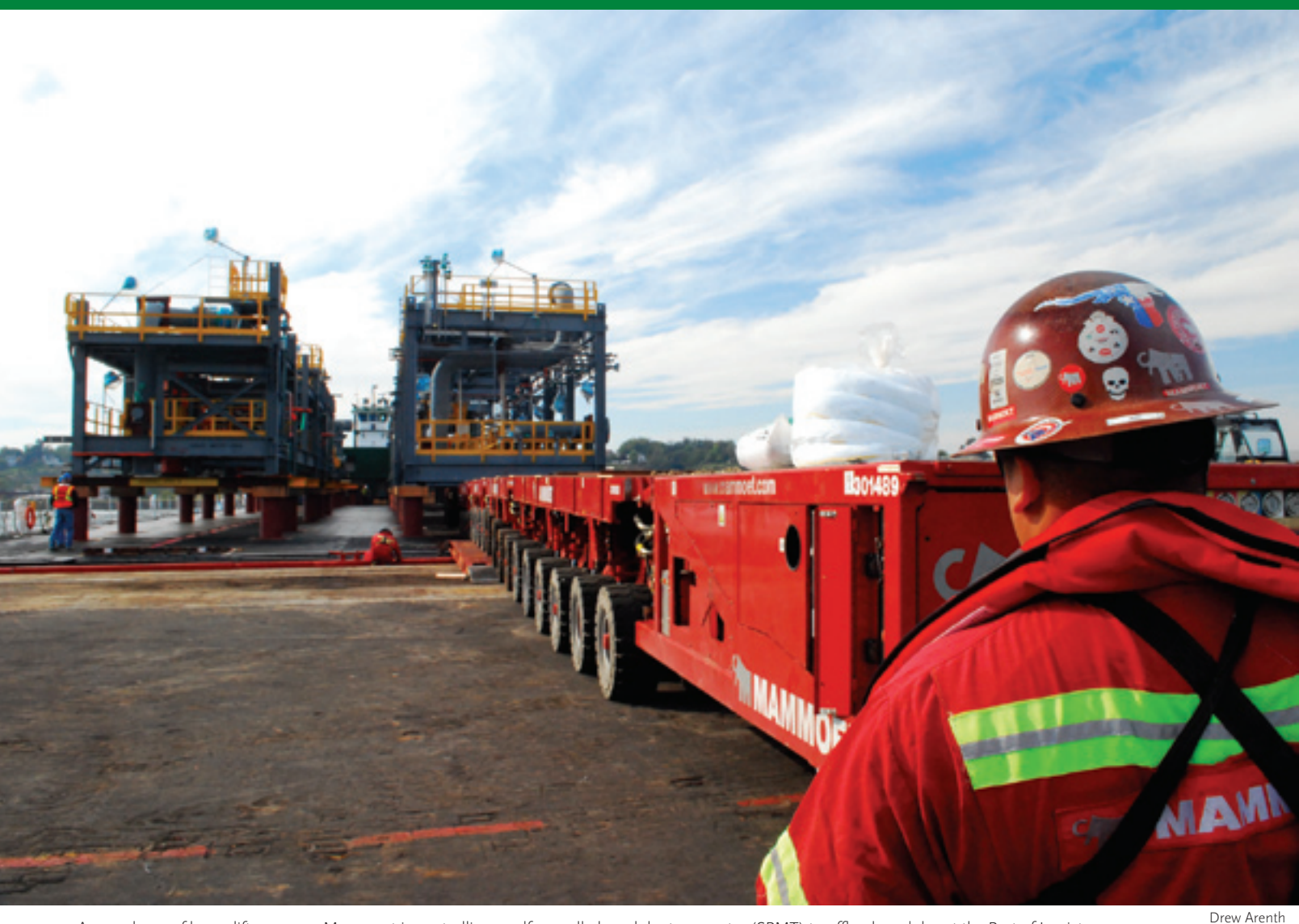
An employee of heavy-lift company Mammoet is controlling a self-propelled modular transporter (SPMT) to offload modules at the Port of Lewiston.