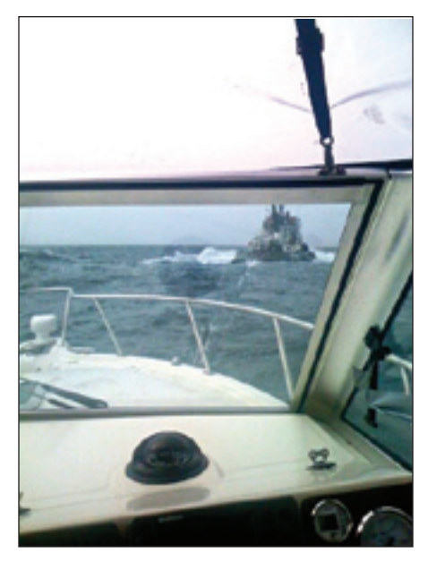
The tug Edith Foss, seen through the windshield of the Extasea.