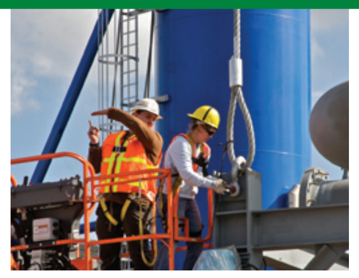
A longshoreman fixes a shackle to a module before it is lifted onto a Foss barge at the Port of Vancouver.