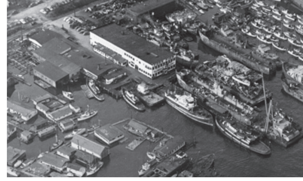
A 1949 photo of the current Foss property on Ewing St. The carpenter shop and other repair facilities are located in the buildings to the left of the white administration building. The area where the current shipyard and terminal are located was used as moorage for war surplus vessels purchased by the Foss family, as well as barge storage and public marinas. The building currently housing the Purchasing and Billing Department is also visible in its current location, just to the right of the back of the administration building.

The Tacoma operations continued to expand rapidly, with the family purchasing several more surplus tugs and barges for use in gravel, chip, oil and chemical towing. A larger facility was needed for the expanding operations, so another move was necessary-this time in 1944 to 225 East F Street on Tacoma's Middle Waterway. This was the final location change in Tacoma, although the facilities have been upgraded over the years. The headquarters included management offices, accounting, payroll, operations, and dispatch. For the vessels, a complete store, shoreside repair facility, paint factory, a marine ways and a drydock able to handle the largest of the ocean going tugs which had been added to the fleet