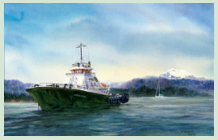
October , Awaiting Assignment – Fidalgo Bay, Julie Creighton