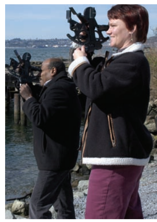
Cadets practice with sextants as part of their training at Pacific Maritime Institute. Those in the photo will work for companies other than Foss.

uses the internet to recruit more than a million drivers a year.