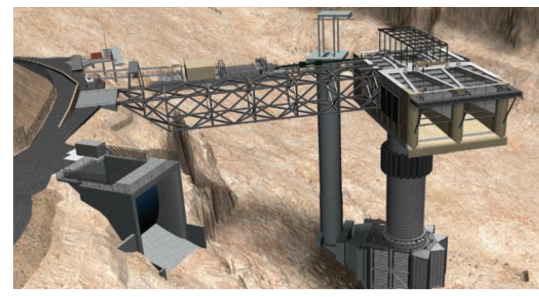
An artist's rendering depicts the fisheries enhancement project to be built above Round Butte Dam.

The withdrawal structure will provide a surface current to attract and collect migrating fish. The fish will be collected, sorted and taken down-