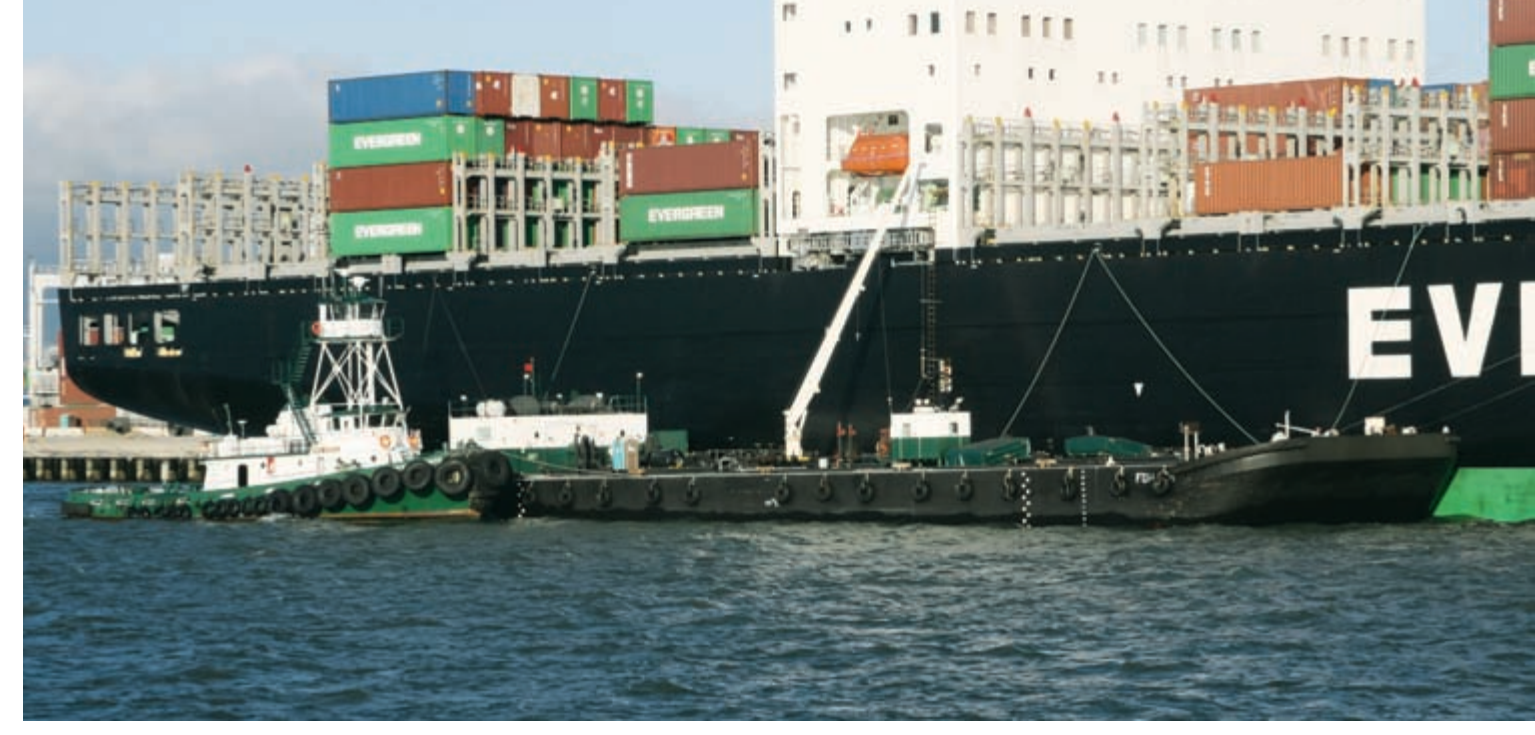
The tug Point Vicente, with its new pilothouse tower, assists one of Foss' new double-hull tankbarges, the FDH 35-1.