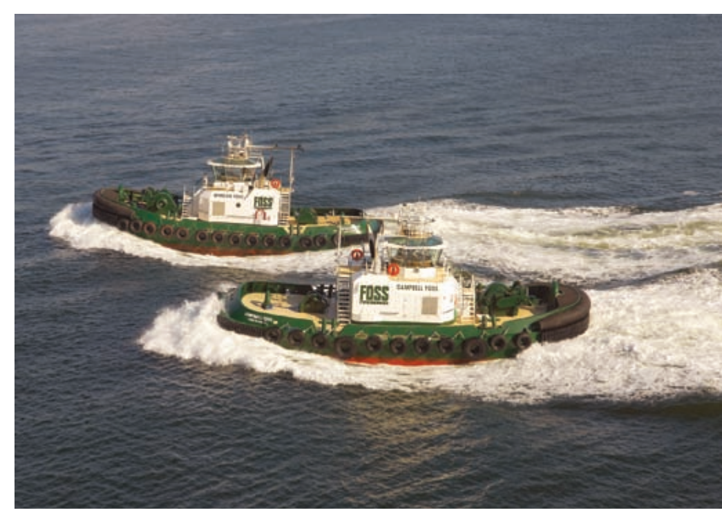
Foss' twin Dolphin-Class tugs in Southern California, the Campbell Foss, foregrounnd, and Morgan Foss.

The design requirements are different for boats that assist ships in