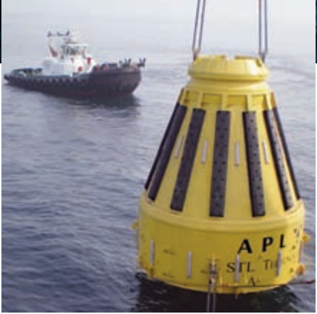
The Leo stands by as a subsurface buoy is lowered into the water.

"Hopefully, we can make another contract with Constellation."