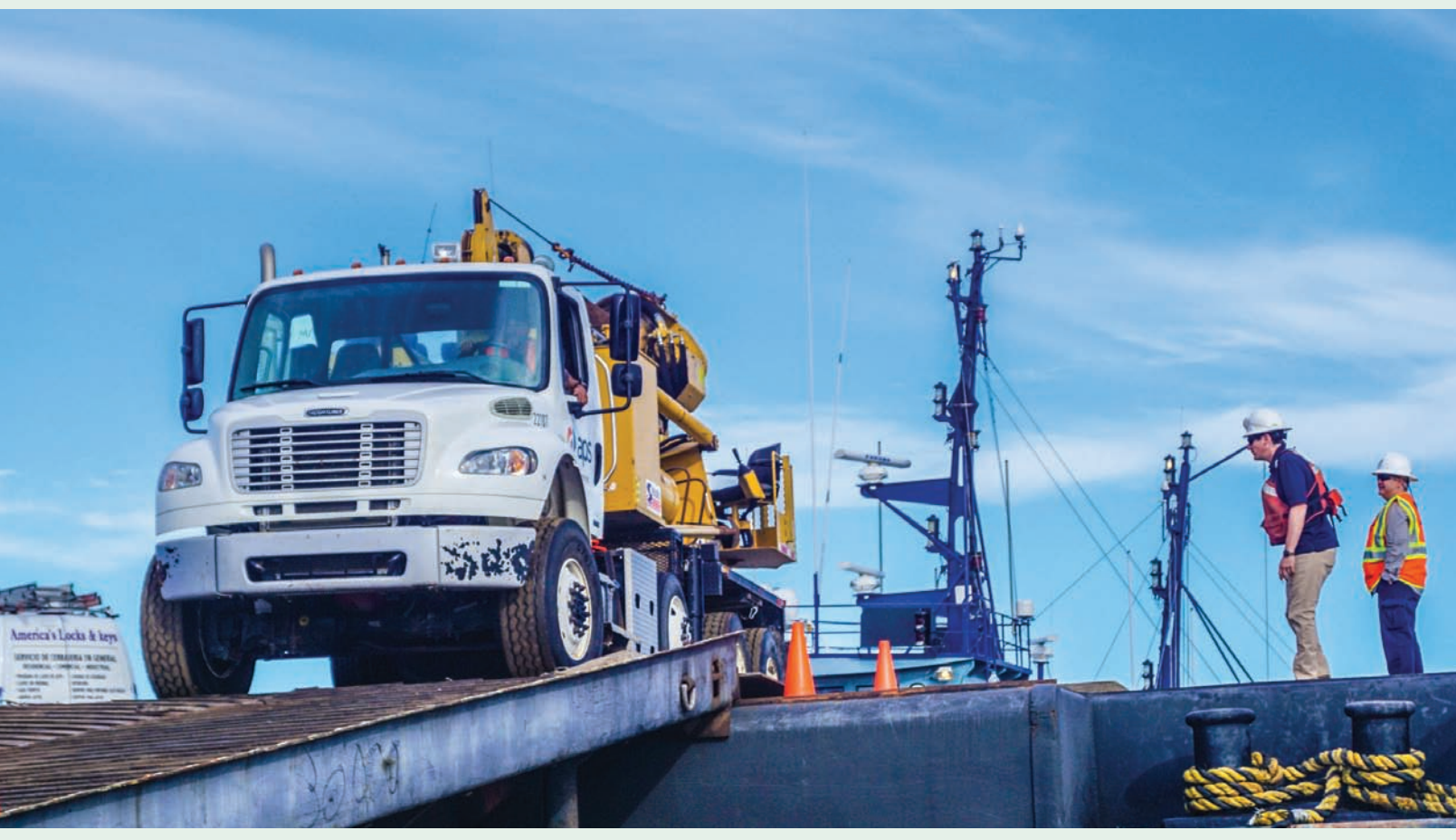
The utility vehicles barged to Puerto Rico by Foss will boost the effort to fully restore power to the island.

"It was an amazing collaboration between Foss and the utility companies to help restore the power grid in Puerto Rico." – CAPT. PETER RONEY