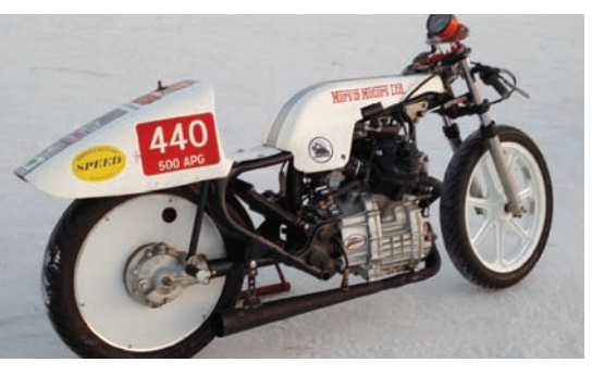
The record-setting bike was a land-speed bike 'project' that involved a rebuild and reconfiguration.

"I guess I like the adrenaline of racing and taking a bike to top speed, and the challenge of pushing myself." - CASEY MEYER