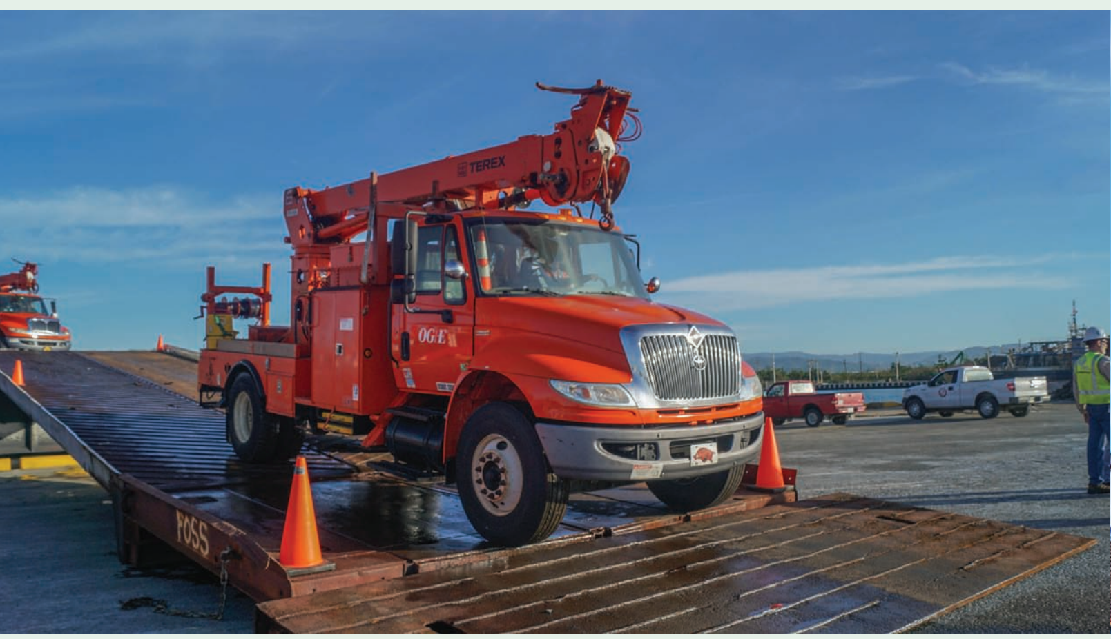
One of 563 utility vehicles delivered by Foss to Puerto Rico rolls off a barge at the Port of Ponce.