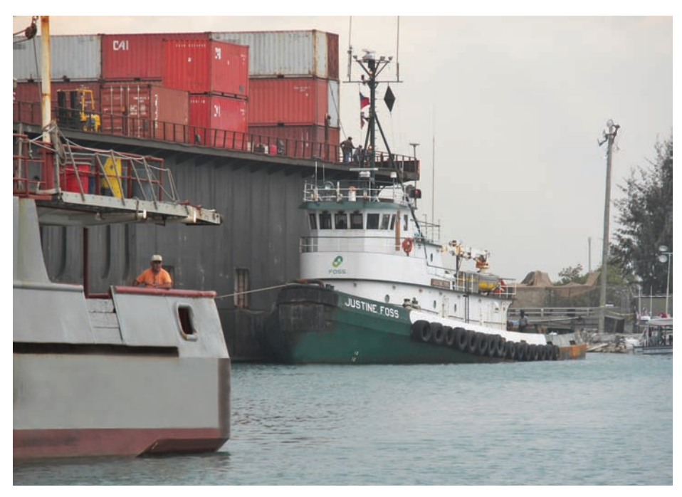
The Justine Foss and barge American Trader arrived in Port-au-Prince on Feb. 1, 2010, with 6,150 tons of food, making the first post-earthquake delivery to Haiti.

In mid-February, ACTC was loading another barge in Houston,