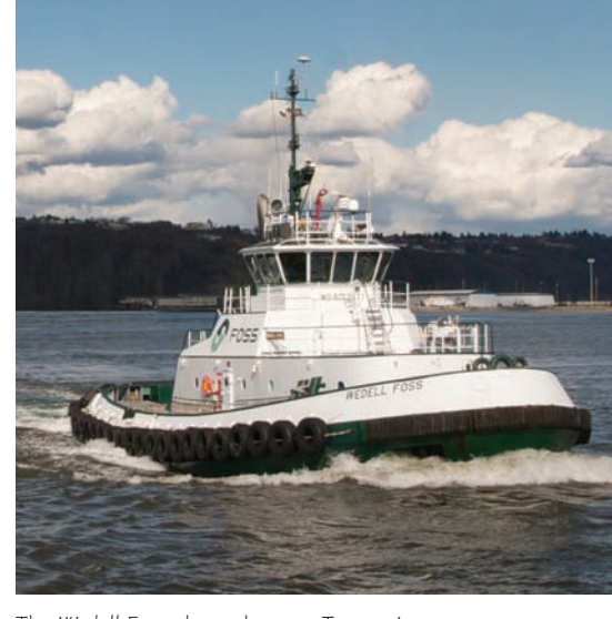
The Wedell Foss, shown here on Tacoma's Commencement Bay, is one of 11 Foss vessels with 20 or more years of environmental excellence.

"These awards celebrate the dedication to environmental excellence of our seafarers and the company personnel shore-side who operate our vessels to the highest standards," said