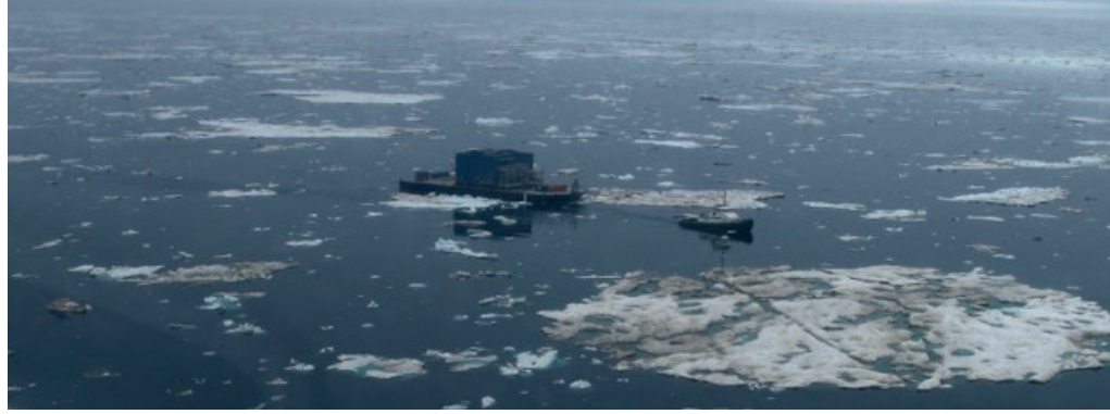
The Michele Foss moving through the ice choked waters of the Arctic.

the second Arctic Class tug, the Denise Foss, at our Rainier shipyard; a return to Eastern Russia's Sakhalin Island with a tug-barge convoy supporting oil field development; the Marshall Foss and her crew answering the ancient call of Mariners to rescue a vessel in distress off the coast of Vancouver Island; and many other accomplishments too numerous to name.