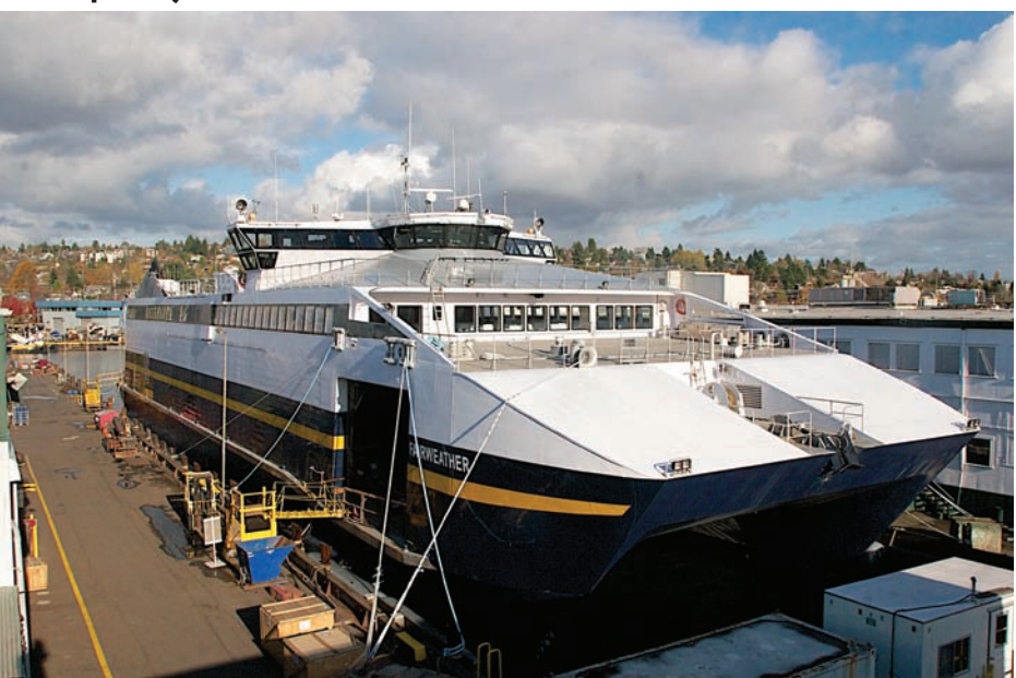
The Alaska ferry Fairweather and a sister ship provided important work for the shipyard.