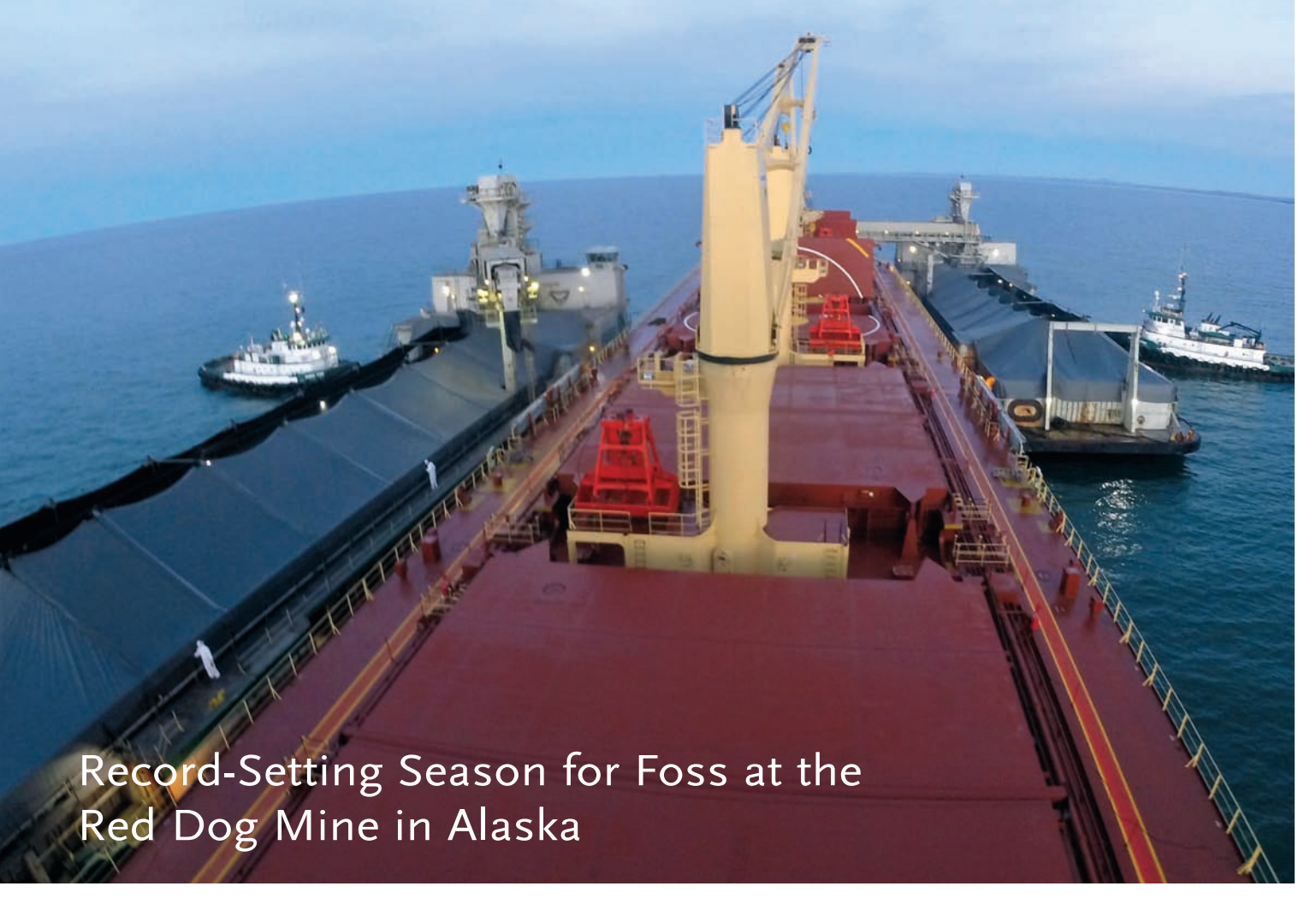
For the first time in many years, two barges were alongside a bulk carrier, discharging ore at the same time.

The Foss Red Dog team handled record tonnage of zinc ore and the second best combined tonnage of zinc and lead during the 2016 season, in spite of enduring its worst weather ever at the mine in the Alaskan Arctic.