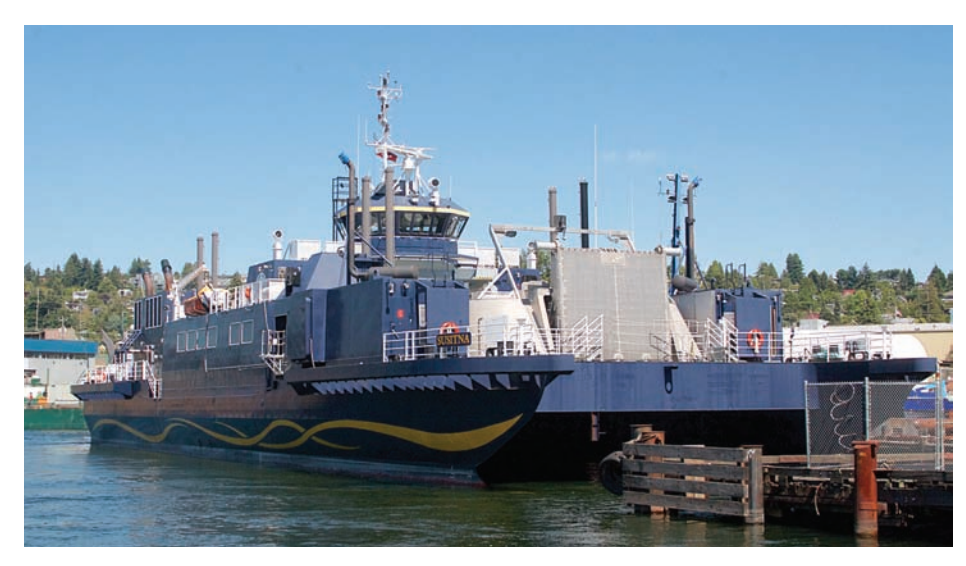
The yard replaced engines and performed maintenance work on the Susitna.

our overall returns. The team has done a great job at planning work, making sure we're as efficient as possible and making sure we're not over spending or under delivering."