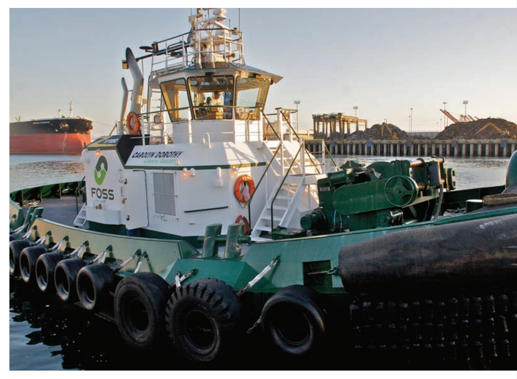
The Carolyn Dorothy, the world's first hybrid tugboat, is now stationed on the Columbia River.

manager of West Coast harbor services, said transferring the Carolyn Dorothy is a demonstration of the company's strong commitment to its mariners and customers on the Columbia River.