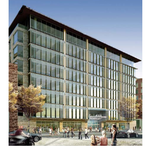
Rendering of the Saltchuk headquarters building.

The developer of the building is Los Angeles-based Hudson Pacific Properties. NBBJ is the architectural