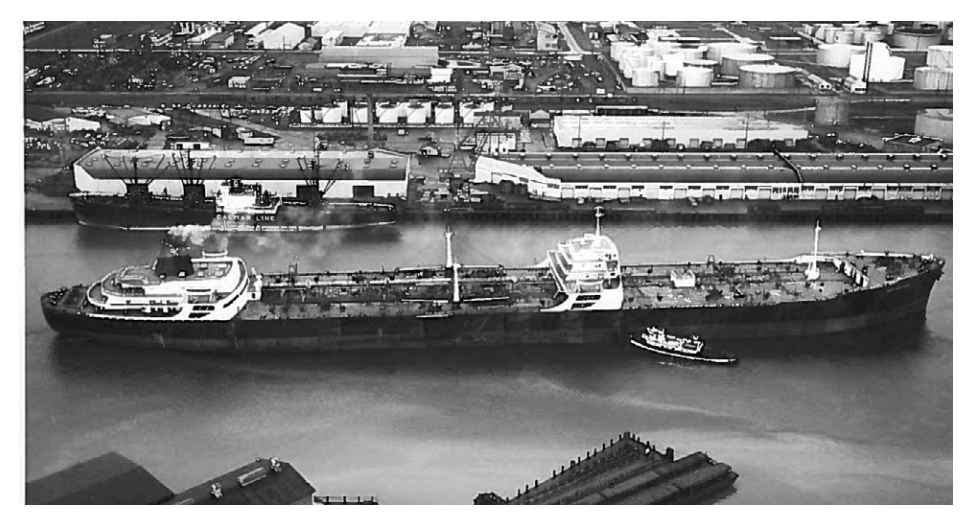
The Lummi Bay , standing by the Manhattan while the ship sat in the "bathtub" during low water in Seattle's east waterway.

Three Foss tugs, the single-crew tugs Wedell Foss (1,600 horsepower), Lummi Bay (1,270 horsepower) and Donna Foss (1,500 horsepower), assisting the Manhattan into the grain terminal at Pier 25 in Seattle.